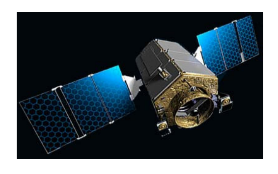
Figure 4. Kompsat-2

KOMPSAT-2's main mission is to be able to launch into the region of the Korean peninsula to monitor natural disasters on a large scale and utilize each resource to grasp a sound understanding of its actual conditions, and to offer highresolution earth observation images through the application of Geographic Information Systems (GIS). For the accomplishment of such a mission, KOMPSAT-2 is scheduled to board a Multi-Spectral Camera (MSC) that will capture 1m resolution panchromatic images and 4m resolution multiple band images. KOMPSAT-2 does not only have the ability to observe images of the Korean peninsula, but also of the lands worldwide. High-resolution digital maps and color images similar to maps which are spread over a diverse range of bands being of high quality and giving added value to the image, can be produced with the use of KOMPSAT-2. Because KOMPSAT-2 is being developed with the foundations of KOMPSAT-1's developmental experiences, through KOMPSAT-1's development industry, the accumulated techniques and manpower is being applied for maximization. Also, following behind KOMPSAT-1, it will continue to conduct Earth observations, the images accumulated will be applied afterwards as being of high added value.