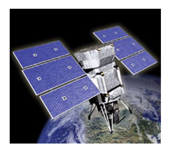
Figure 2. Worldview