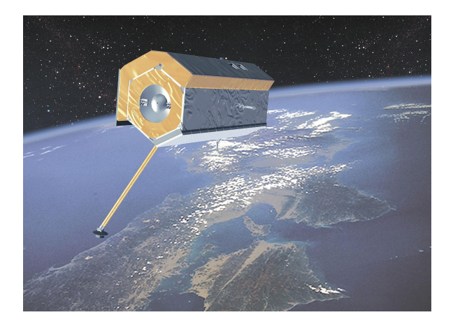
Figure 5. Terra-SAR

For achieving a high spatial resolution, a technical trick is used: The satellite moving at very high speed along its ground track keeps receiving and accumulating the echo of a great number of emitted radar pulses. This simulates a very large radar antenna depending on the distance the satellite meanwhile moves forward. This trick is what synthetic aperture means. Thus the spatial resolution is increased as it is a function of the antenna size.