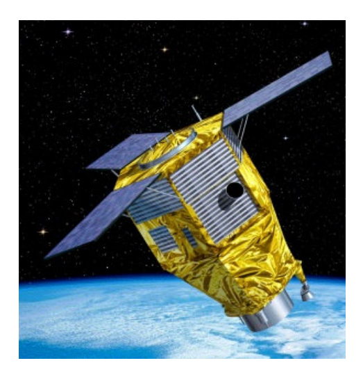
Figure 3. Pleiades